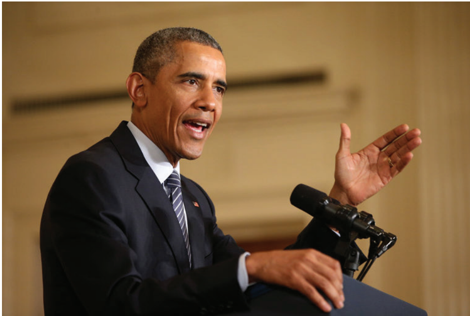
Obama called the Clean Power Plan “the single most important step America has ever taken in the fight against global climate change.”